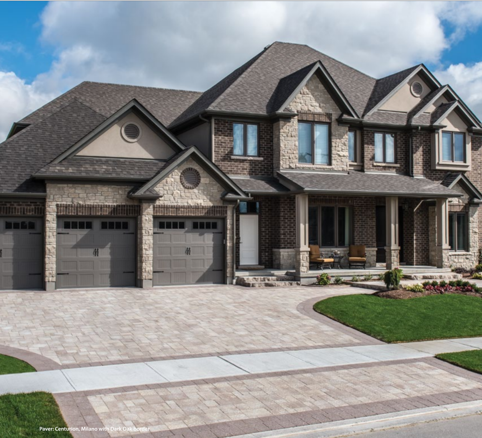
Paver: Centurion, Milano with Dark Oak border

Featuring a charming weathered surface, this 70mm (2.76") thick paver is designed to stand up to pedestrian and vehicle traffic and last a lifetime. Ranging in sizes from Small to Double Jumbo, Centurion pavers allow for limitless design options, with Standard through Double Jumbo units packaged individually. Also available in a Combo bundle as shown.