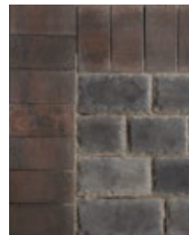
MOUNTAIN & SALEM BLEND WITH MARKET PAVER, SERENGETI

Enviro Passagio pavers with ColorBold™ technology as an integral part of this product provide a new level of color longevity and stain resistance, while our EliteFinish™ delivers richer and more vibrant color and a harder wearing, more durable and smoother textured surface.