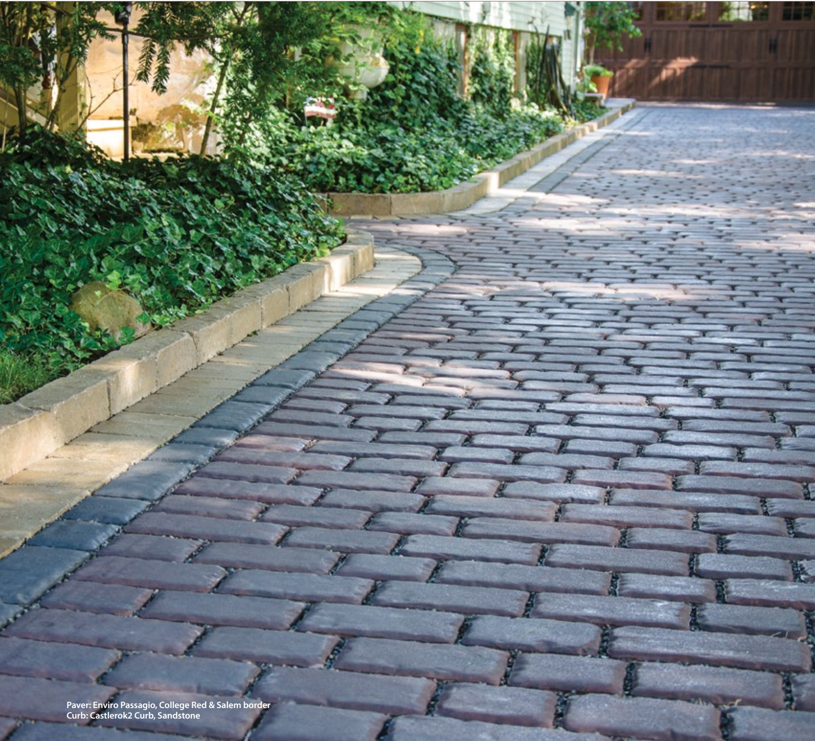
Paver: Enviro Passagio, College Red & Salem border Curb: Castlerok2 Curb, Sandstone

This cobble-style 70mm (2.76") thick paver offers a modern take on European styling with the added benefit of permeability. With subtly blended colors, an appealing texture and joints that allow for optimum water flow, Enviro Passagio is a beautiful choice for reducing rainfall runoff and puddles on driveways and patios.