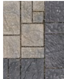
SILVERSAND WITH ONYX SAILOR COURSING

Note: Sailor coursing shown uses 4x8, 8x8 and 8x12 in a running bond (Sailor course).