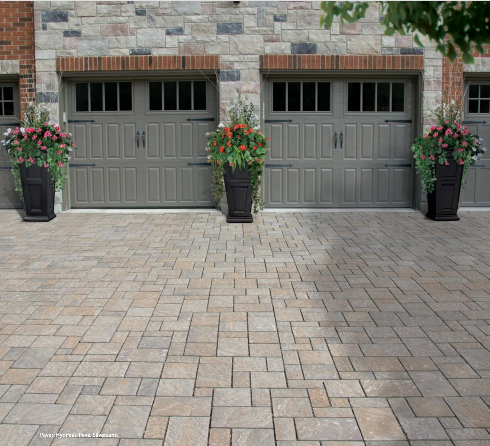
Paver: Hydr'eau Pave, Silversand

Distinctively textured with the look of natural stone, these permeable paving stones are designed to reduce excessive rainfall runoff. Hydr'eau Pave allows for optimum water flow – through joints and into the base, sub-base and sub-soil – reducing erosion and preventing sediment build-up. With an 80mm (3.15") thickness, they are ideal for pedestrian and moderate vehicle traffic. Combine with other Oaks products of the same thickness to create unique designs.