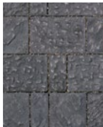
ONYX Ideal for sailor or soldier coursing.