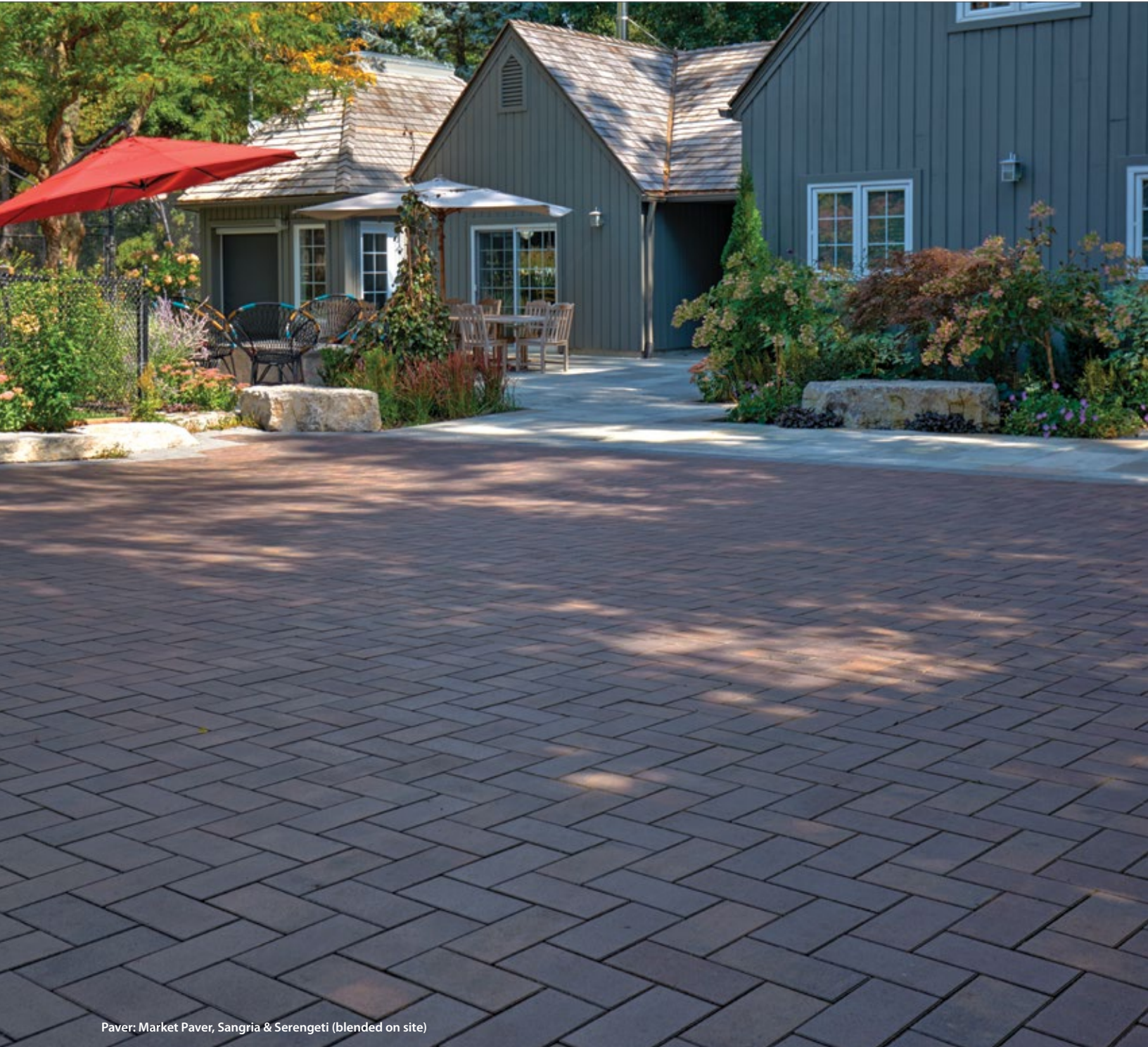
Paver: Market Paver, Sangria & Serengeti (blended on site)

A modern take on heritage, this traditionally-styled 4x8 paver delivers a sophisticated appearance and enduring quality stylishly re-engineered for modern design. The richly-blended tones will endure the elements and significant wear-and-tear as we have incorporated both ColorBold™ and EliteFinish™ technologies into their manufacturing process. At 70mm (2.76") thick, Market Paver is suitable for both vehicular and pedestrian traffic.