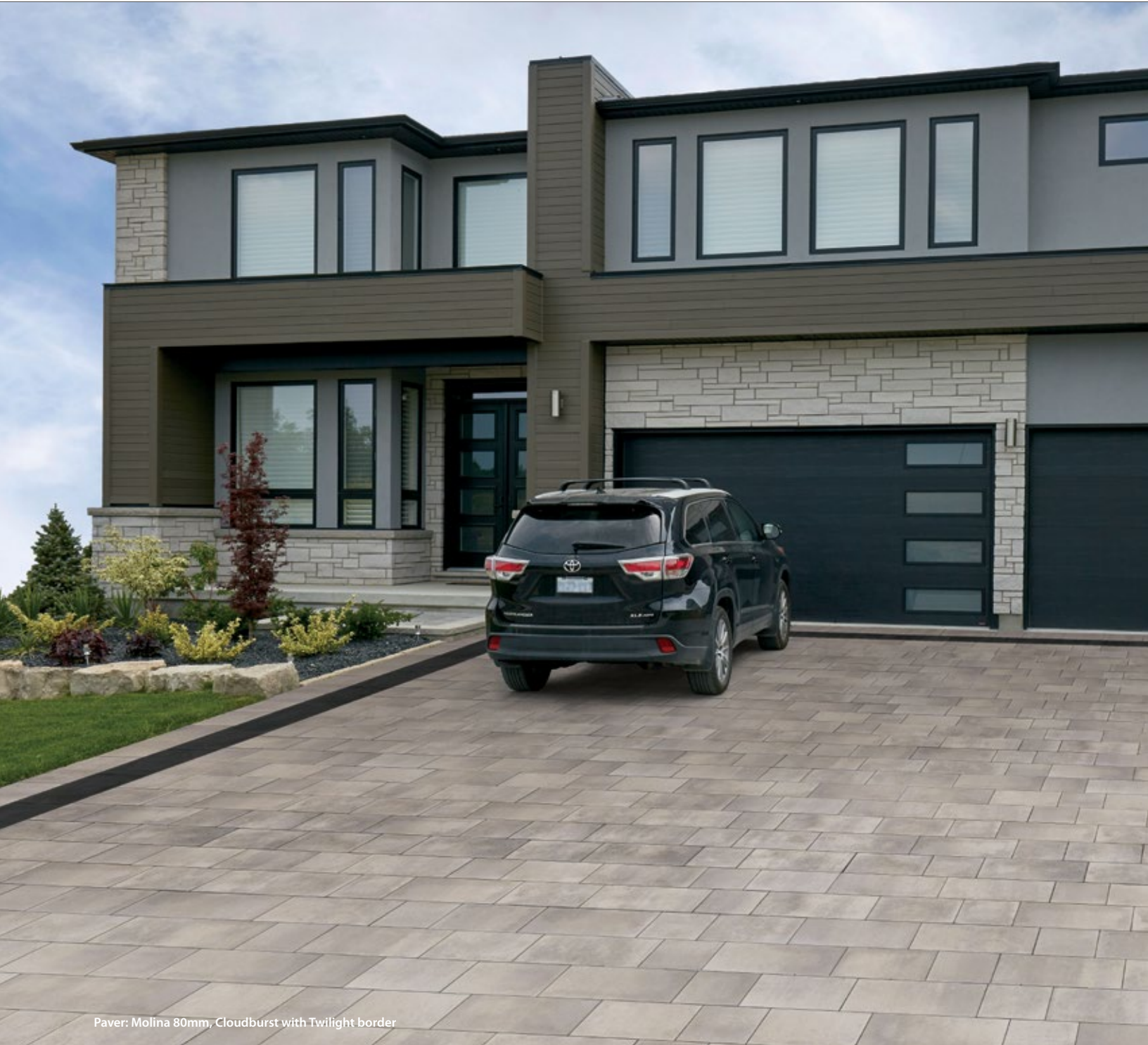
Paver: Molina 80mm, Cloudburst with Twilight border

The Molina line from Oaks enables holistic design concepts for your project. With its large format, smooth surface, clean edges and reduced joint spacing, Molina is ideal for creating inviting spaces, and meets wheelchair access specifications. At 80mm (3.15") thick, this paver is best suited for light traffic in areas such as driveways or parking areas, while our new 60mm (2.36") thickness offers complete versatility for use in pedestrian areas.