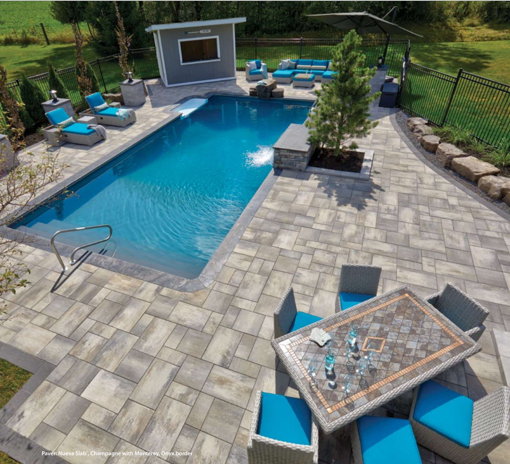
Paver: Nueva Slab®, Champagne with Monterey, Onyx border

For a truly sleek and modern-looking project, Nueva® Slab delivers a tile-like appearance with its smooth face, clean finish and subtly-chamfered edges. This 50mm (1.97") slab integrates perfectly with our Nueva® wall and step systems, to make product choices a breeze. Also fully compatible with our textured 50mm slab products, Rialto and Monterey, custom design options with smooth & textured combinations, or banding and accents mean that your project can easily reflect your unique creativity.