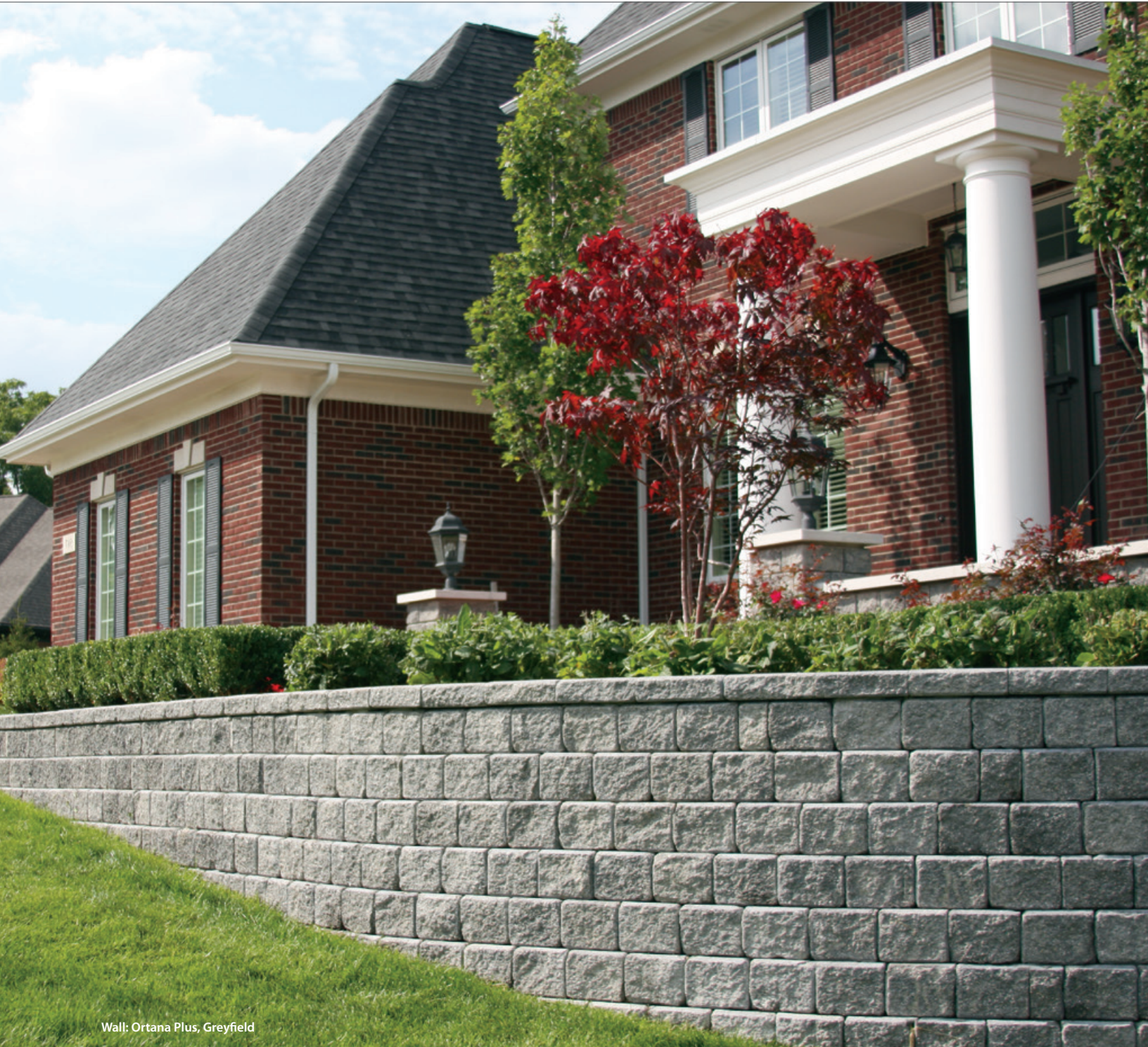
Wall: Ortana Plus, Greyfield

These aged and weathered-looking blocks feature a rear removable tongue for an even, consistent look in vertical walls and corner units. Ortana Plus can be easily converted for designs featuring double-sided walls, seat walls and driveway borders.