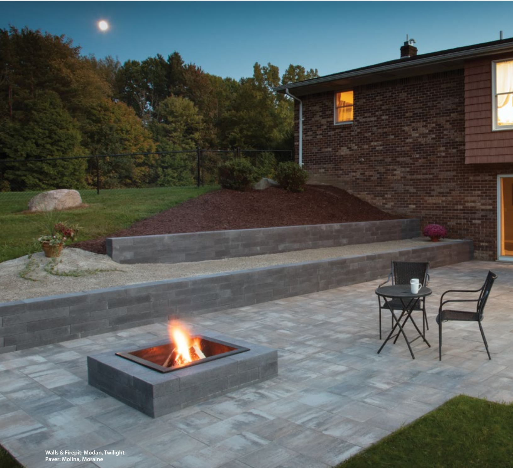
Walls & Firepit: Modan, Twilight Paver: Molina, Moraine

With a striking smooth surface, faintly beveled edges and a palette of subtly-blended colours, the sleek Modan wall system is the perfect choice for contemporary outdoor designs. The four linear-proportioned wall blocks are packaged together as a combo bundle, while the Linear Unit is also packaged separately making it ideal to use as accent banding for pillars, or as an independent system.