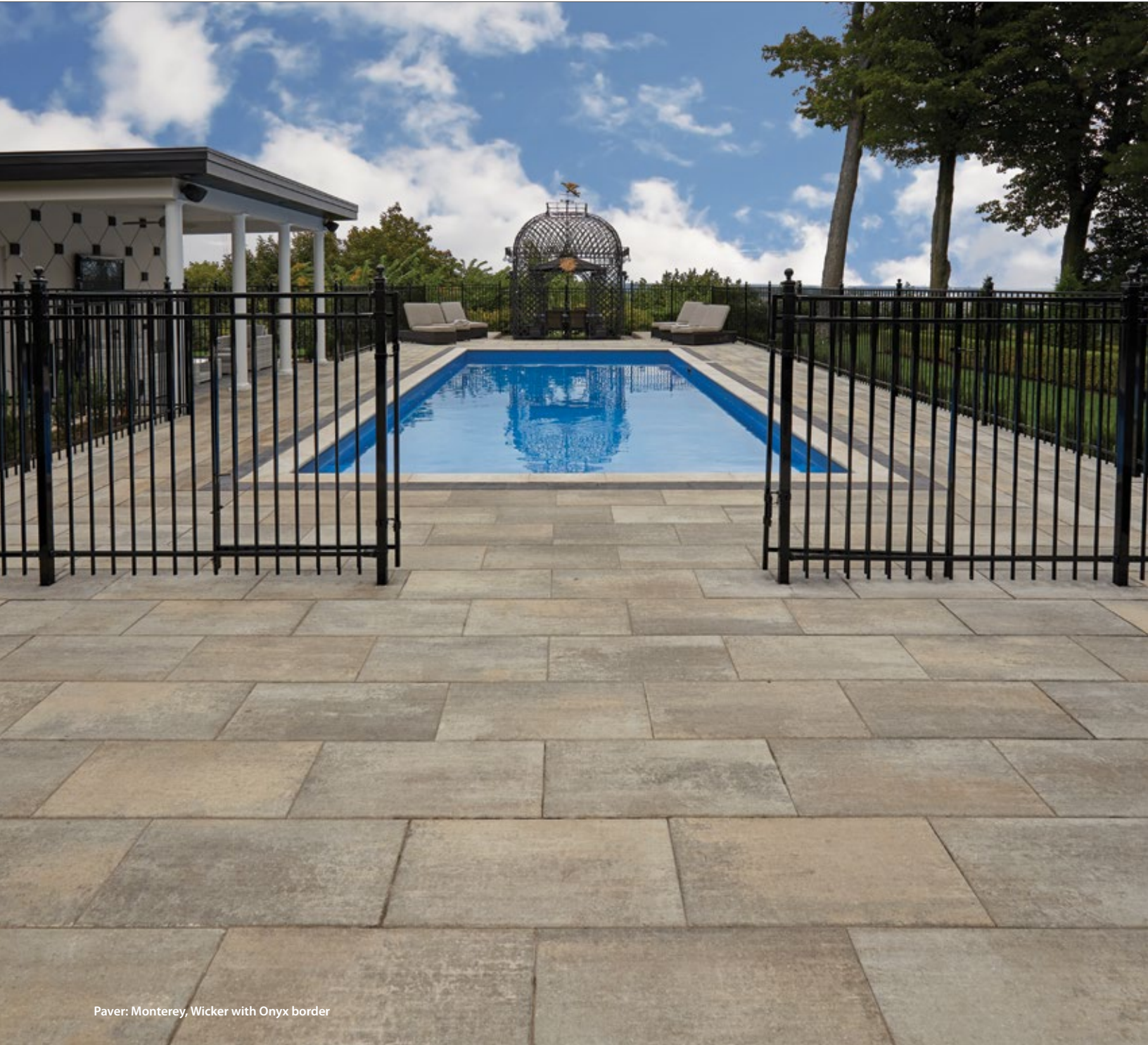
Paver: Monterey, Wicker with Onyx border

This architectural slab features a softly-textured surface and uniquely undulating spacers (in the 8x16 size) for use as coping, cap or step. Monterey's clean lines, appealing earth tones and availability in five sizes and three packaging options make it an ideal choice for creating a relaxed West Coast vibe. At 50mm (1.97") thick, it can be combined with Rialto or Nueva Slab for a unique effect.