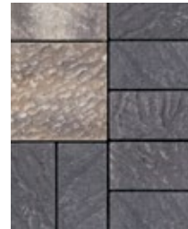
CHAMPAGNE WITH ONYX BORDER