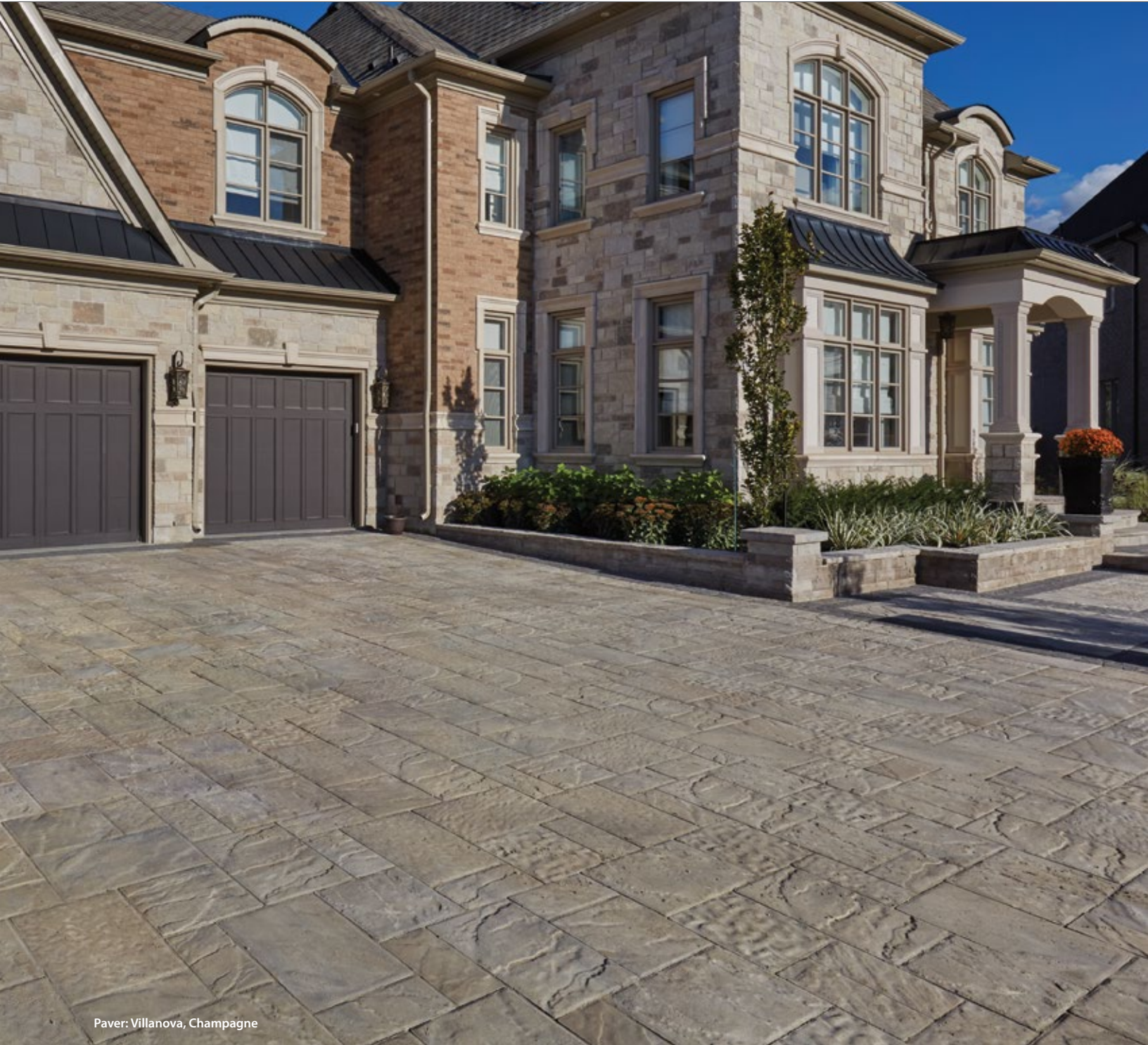
Paver: Villanova, Champagne

This large-scale 80mm (3.15") thick paver offers a natural stone look with accentuated contours and is suitable for both pedestrian and vehicle traffic. Design flexibility is limitless with Villanova's 3-piece paving system: 8x16, 16x16 and 16x24 sizes. Create an upscale look by using 15 different textures of the 8x16 size in a herringbone pattern, or enhance the scale by adding square and large rectangular units.