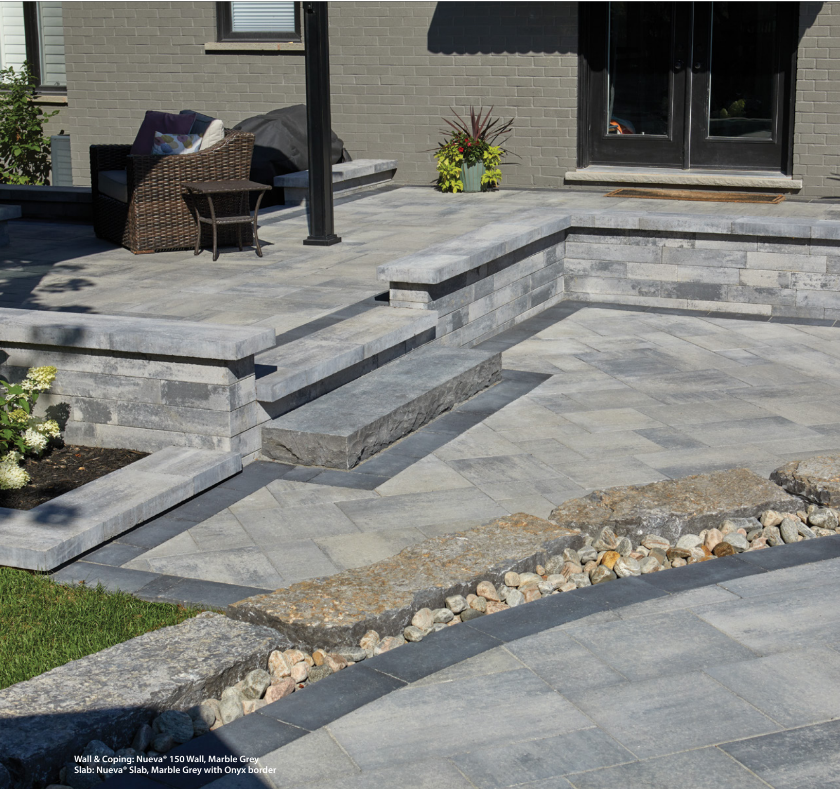
Wall & Coping: Nueva® 150 Wall, Marble Grey Slab: Nueva® Slab, Marble Grey with Onyx border

Today's outdoor design trends call for clean lines, contemporary style and a well-coordinated color palette. Nueva® 150 Wall was designed with the versatility and strength required to help homeowners and design professionals increase usable space by managing troublesome grade changes, with a sleek profile and double-sided smooth face. With Oaks patented M-Lock technology and hollow cores, Nueva® 150 Wall allows for the use of stabilized backfill for the ultimate stability in the most challenging and true vertical applications.